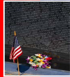
Vietnam Memorial Traveling Wall

Parking available at Grimes Park and surrounding areas.